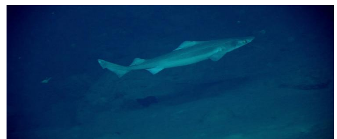
Fig. 1: Centrophorus Granulosus from science learning Hub in 2024