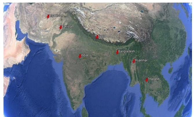
Fig. 2: Distribution of Sperata seenghala in South Asian regions

iron. The relative estimates for the moisture, crude protein, crude fat, and ash content were 79.40 \pm 0.09 , 20.06 \pm 1.13 , 1.40 \pm 0.79 , and 0.90 \pm 0.08\% (Mohanty et al. 2012). Amounts of various elements are given in Table 3.