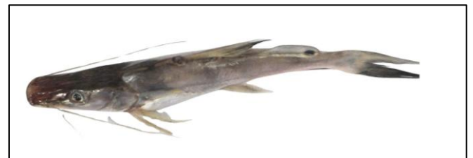
Fig. 1: Sperata seenghala

D.1/7; P.1/9; V.6; A.11-12 (3/8-9); C.19-21, Barbels four pairs. (Das 2021)